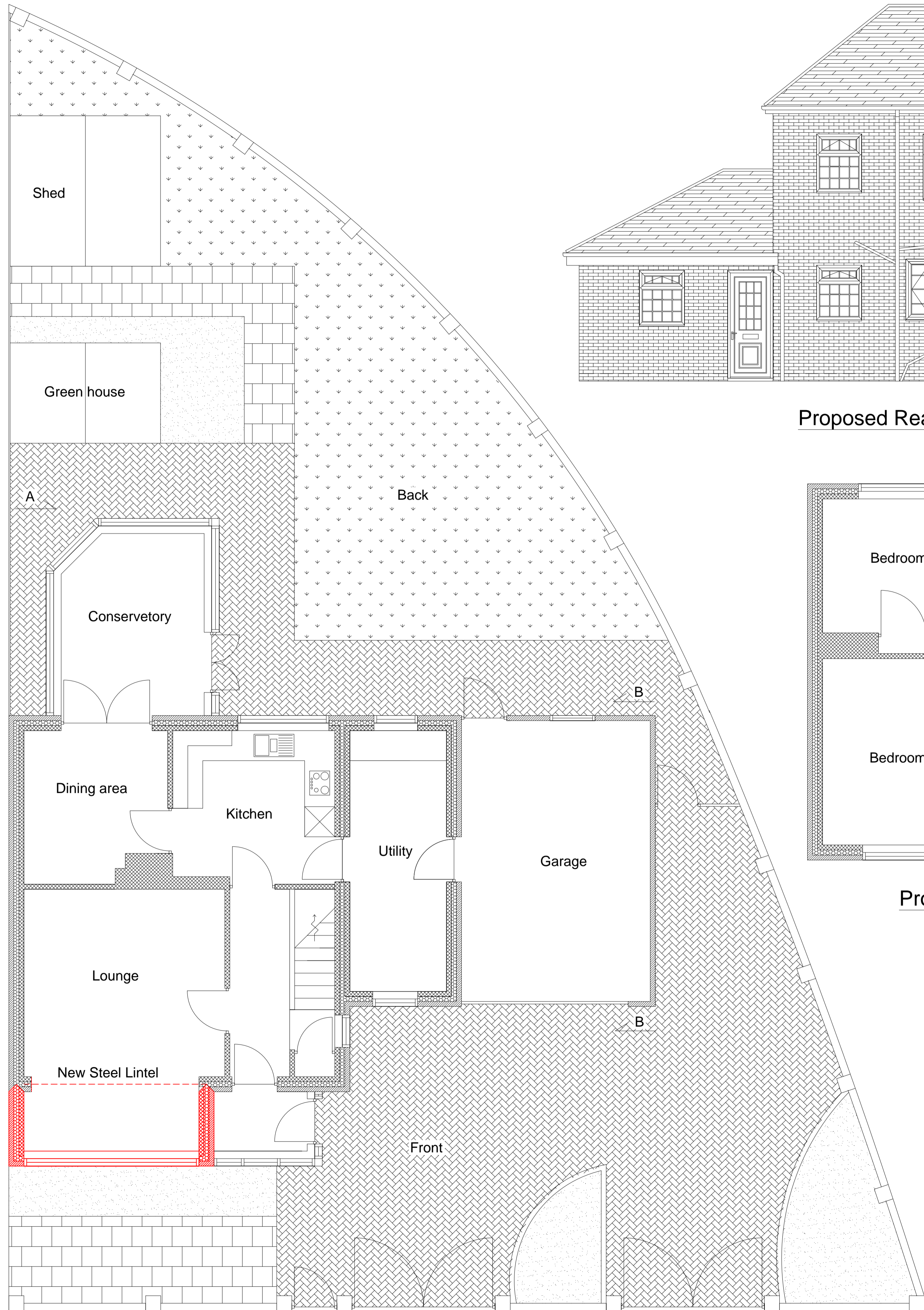
Proposed Ground Floor Layout